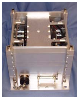
Electronics Stack with Integrated Heat Spreader