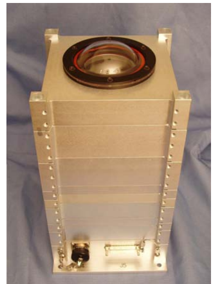
Waterproof Embedded Camera System